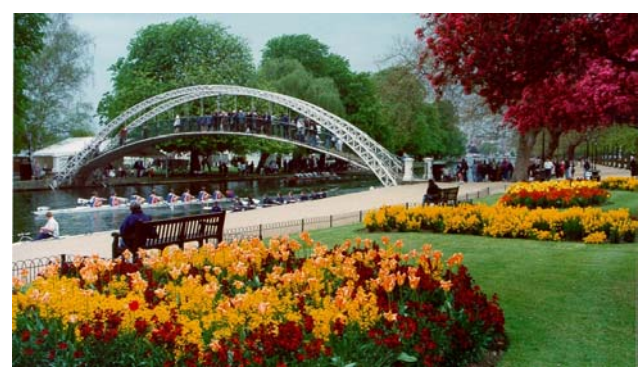
The Embankment and River Ouse, Bedford

Full paper: 31 March 2005 Final paper: 31 May 2005 Registration: 30 June 2005