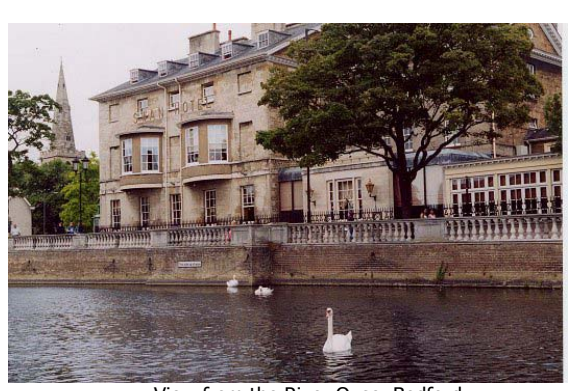
View from the River Ouse, Bedford

All papers will be refereed by international experts and published in the conference proceedings. It is proposed that selected papers will be published as a book by a reputable academic publisher. Further selected papers will be published in special issues of international journals, includina Advanced Manufacturing Technology, Production Research and Business Process Management.