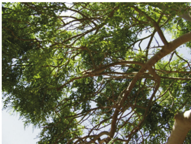
Figure 1. Moringa stenopetala ( M. stenopetala ) [1].

Moringa leaves [3]. Rutin being naturally sourced from plants for its various nutraceutical and pharmaceutical usage, the African Moringa now turned out to be a good potential candidate for isolating this biomolecule. Rutin is also a known antioxidant, antidiabetic and multifunctional natural compound that could be responsible for the variety of medicinal claims of the leaves of the African Moringa [5]. Coincidentally, it is the Southern regions of Ethiopia (namely ‘Kaffa’) that gave the world the gift of coffee. It also appears that the active ingredient of coffee, caffeine, is present in many varieties of coffee seeds in less than 2.3% on dry weight basis. With careful selection of plants growing under different environmental conditions and breeding experiments, there is therefore no doubt that a super-variety of the African Moringa that may serve as a better food/medicine could be found.