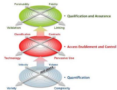
Fig. 2. Extreme information concept [20]

These are considered the main dimensions of big data. In addition to the 3Vs, many authors and companies have been adding features over the time. IBM added veracity as a fourth dimension [8], which refers to trustworthiness of the data. As the number of resources grows, unreliability and inaccuracy inherent in some sources of data increase as well. Variability and complexity were introduced by SAS as two additional dimensions. While variability refers to the variation in data flow, complexity refers to the fact big data are generated through innumerable sources [19]. From earlier studies to the more recent research, the definition of Big Data has advanced. Research sorts out up to twelve dimensions in three tiers with four dimension each. On the first tier, there are the three main big data characteristics of Volume, Velocity and Variety, and Complexity.