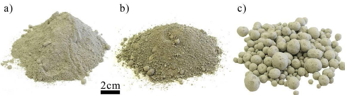
Figure 3: (a) Typical raw waste, (b) Granulated carbonated product (c) Carbonated aggregate product

Products were manufactured using a combined carbonation-induced forming technique described previously (Gunning et al. , 2009). Adjustment of the process parameters and mix formulations allows control over the grain size and shape of the carbonated product. Typical carbonated materials are shown in figure 3. Aggregate development was carried out in two phases. Firstly, aggregates were manufactured according to a standard set of formulations. These were subjected to basic testing (strength, leaching). The results were used to identify the aggregates conforming to the designed specification. Secondly, selected compliant aggregates were manufactured in larger quantities, and subjected to more rigorous testing.