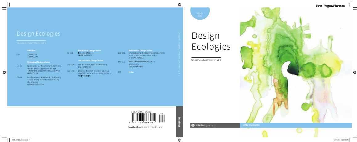
Murray, Shaun, 2014. Tipping Points: Front and back cover, Bristol: Design Ecologies