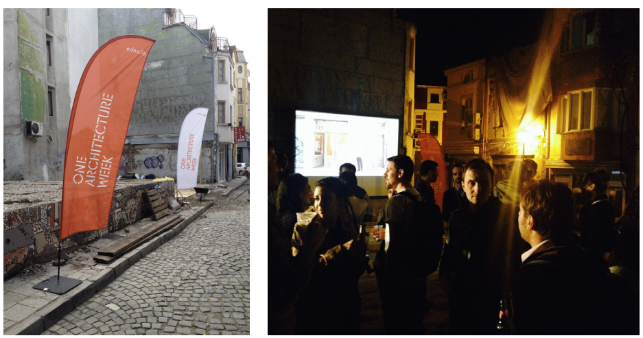
Endless City in One Architecture Week, Plovdiv, Bulgaria