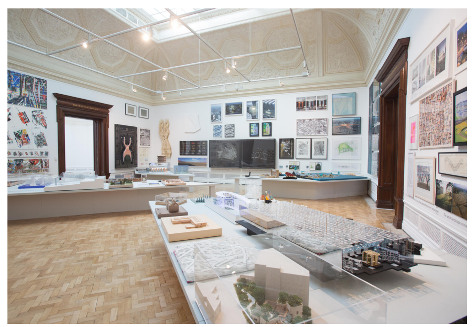
Endless City in Royal Academy Summer Show 2015