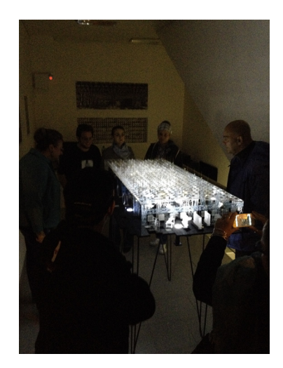
Endless City in One Architecture Week, Plovdiv, Bulgaria