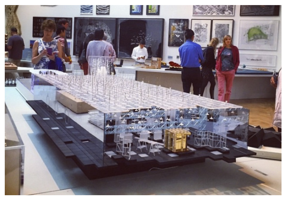
Endless City in Royal Academy Summer Show 2015