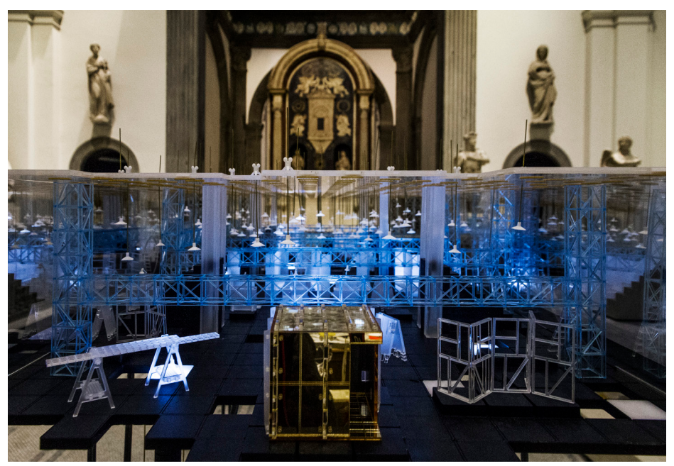
Endless City in Victoria & Albert Museum 2014