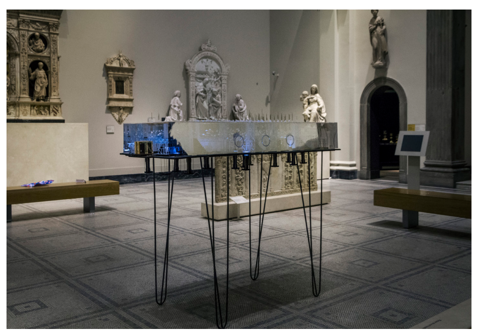
Endless City in Victoria & Albert Museum 2014