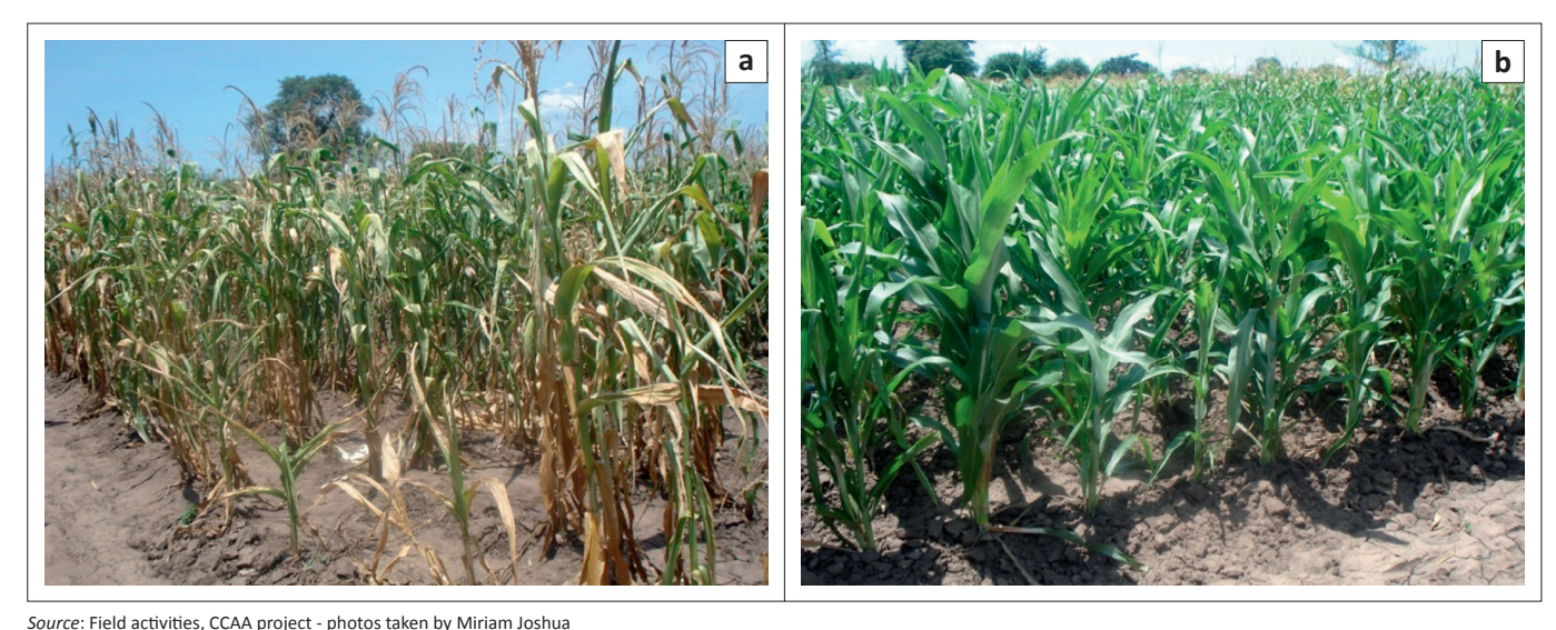
FIGURE 4: Rain-fed plot (a) and another rain-fed learning plot (b) planted a month later during the 2008/2009 season in Mphampha Village.