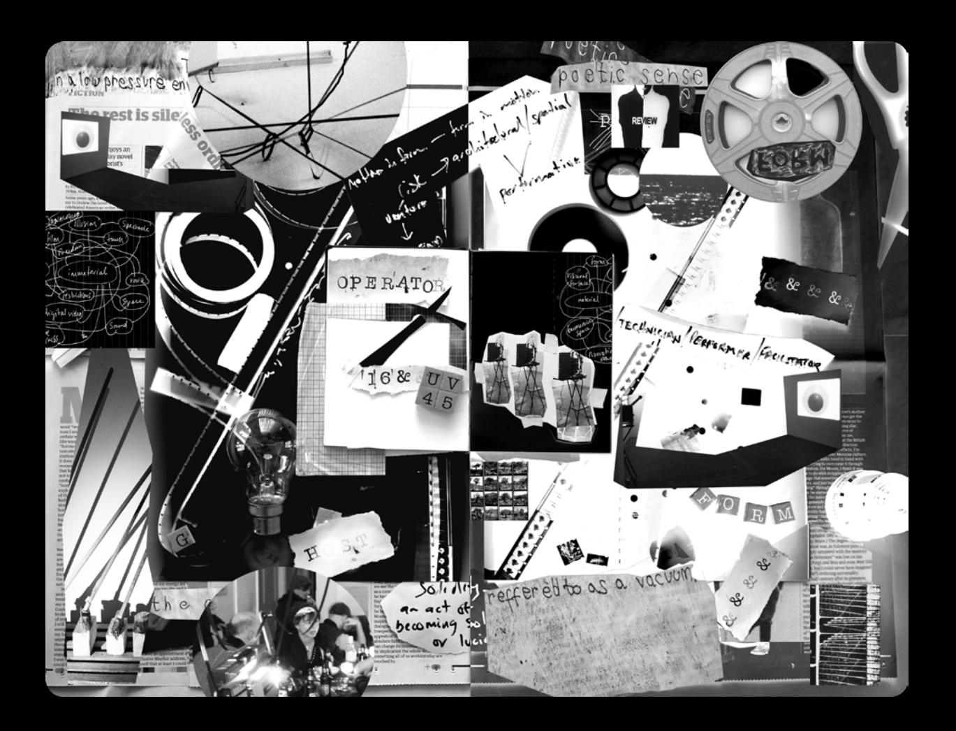
Slade Research Centre December 7 - 10, 2015

Motion in Form II is a four-day event at the Slade Research Centre, Woburn Square, investigating film and moving image through workshops, live performance, lectures, discussions and a public exhibition of film installations. This event builds upon works and concepts discovered through the original Motion in Form * project.