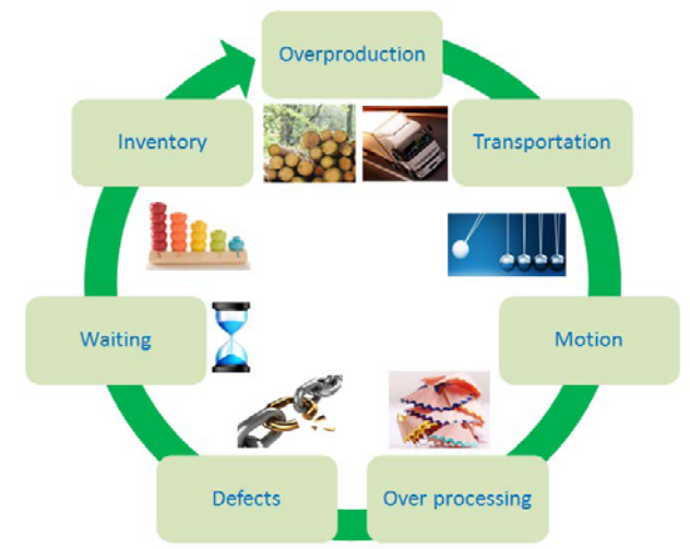
Fig. 1. The Seven Deadly Wastes of Lean Philosophy.

Presently, the service industry is trying to improve its performance by embracing the continuous improvement process so as to stay competitive and satisfy their customers. Hence for them to achieve this there is a need for this service industry to adopt the Lean production practice as a full business strategy. Below are the deadly wastes that affect service industry. The main aim of Lean production is to eliminate all type of waste within the production process. Waste includes all activities that do not add value to organisations or customer. It is any activity that customers will not pay for; thus it is important for organisations to identify the concept of this waste and reduce it. Earlier research by Taiicho Ohno design of seven wastes or "Muda" which form the core of "lean philosophy" that is faced by companies on how to identify and reduce them.