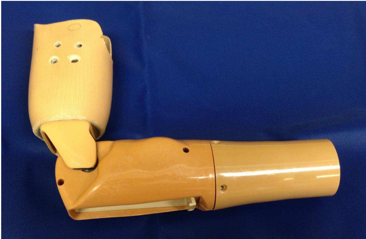
Figure 4: VASI electric elbow for children produced from 1984 to 1987.