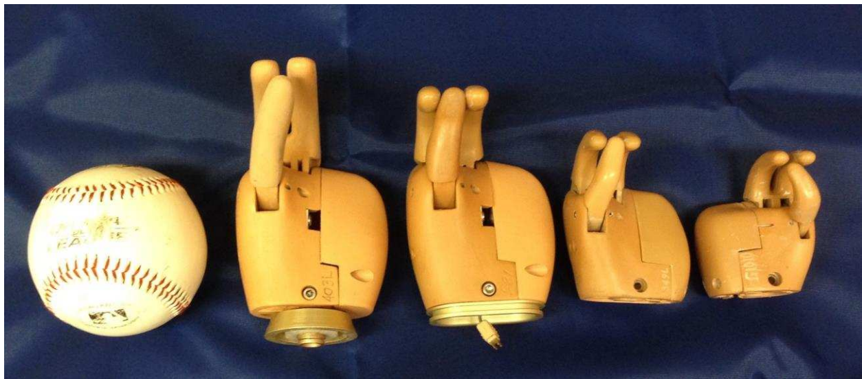
Figure 3: VASI electric hands for children aged 0 to 11 years produced from 1984 to 1987.

The origins of the OCCC's involvement in the research and development of myoelectric upper limbs was in its selection as one of the four PRTUs. In 1964 the OCCC had 600 children registered with its PRTU clinic. Twenty-one of those children were born to mothers who had taken the drug thalidomide while pregnant. 35 The approach the OCCC planned for development was the conventional engineering model of design-build-test, and repeat. 36 Hooks, wrists, hands, elbows and shoulder units were designed and built, tested in the laboratory, and then applied to amputees. VASI hands and elbow are illustrated in figures 3 and 4.