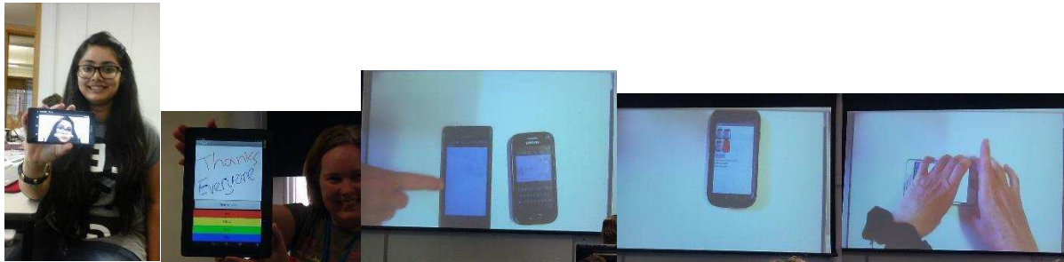
Figure 3: Apps developed at Greenwich

The success of the event at Greenwich was evident from both the formal and informal responses we got on the day and after the event; for example, the participant who developed the app for skaters remarked in an email after the event: