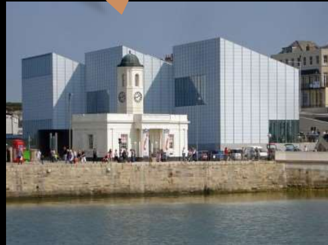
2011, TURNER CONTEMPORARY, MARGATE, UK