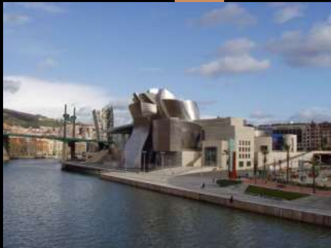
1997 – THE GUGGENHEIM MUSEUM, BILBAO, SPAIN