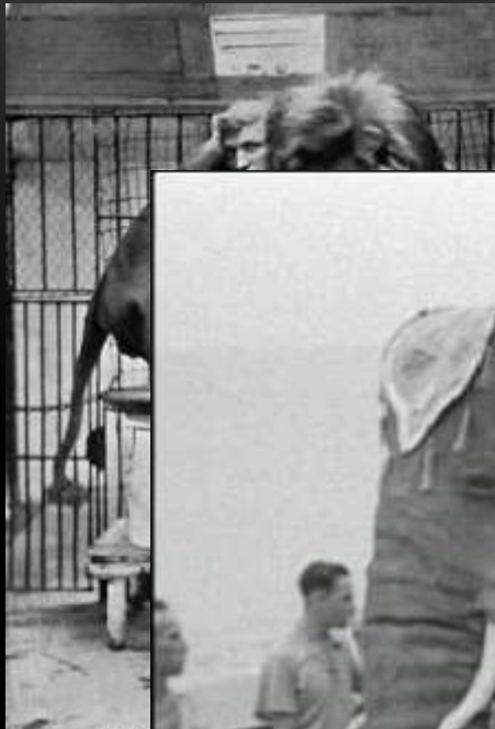
ANIMAL GRAND Walt Disney, LORDB