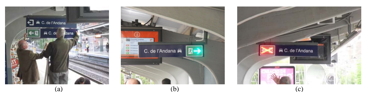
Figure 3: (a) The standard static emergency exit sign and the ADSS (b) flashing exit sign and (c) negated sign.

The second trial, TS2.2, consisting of 152 participants, conducted one week later on the 2^{nd} June, was to assess the participant reaction to the ADSS (see Figure 3b and Figure 3c), which was activated as the same time as the alarm during the trial. The ADSS was configured to direct all participants towards an intended exit, Exit D located at one end of the platform, according to a specific evacuation strategy (see Figure 4 bottom). This was not the nearest exit for the majority of the participant population and therefore required the population to adopt a different behaviour from that exhibited in the first trial. The only intended difference in the trial procedure between the two trials was the signage systems employed (see Figure 4).