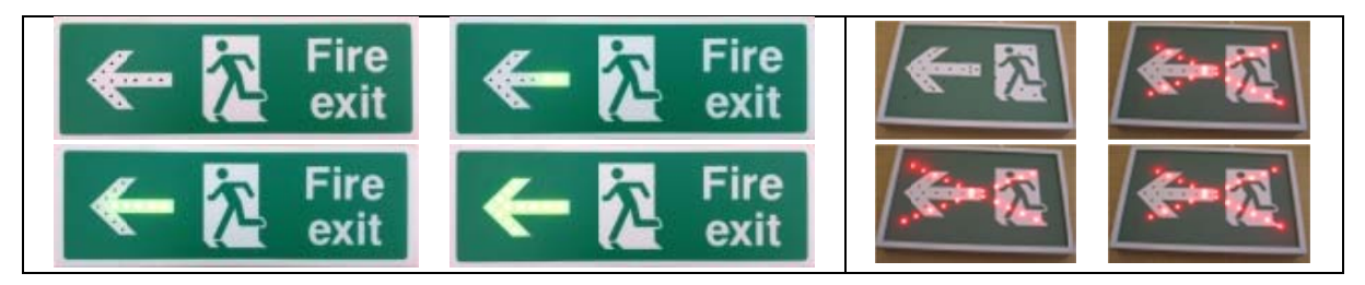
Figure 1: The flashing light signage design (left) and the negated no entrance signage design (right) used in the ADSS.

In this paper we present a series of full-scale evacuation trials that test the ADSS in a rail station application. The specific purpose of the trials was to assess the effectiveness of the ADSS, which adopted the two signage design concepts, in comparison with the standard emergency exit signage system.