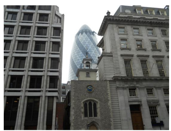
Figure 8: http://anonw.files.wordpress.com/2011/03/ds cn4250.jpg

The history of St. Ethelburga's Church contributes to its discourse of peace and reconciliation. It also offers opportunities of resistance but in ways that are strikingly different from Passing Clouds. The church was bombed by the Irish Republic Army in 1989 but was reconstructed as the 'Centre of Reconciliation'. This venue holds about 50 people and lies in the heart of the Liverpool Street commercial district at 78