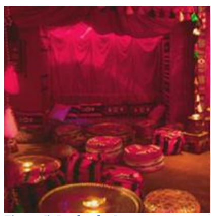
Figure 5: Darbucka Lounge. www.darbucka.com; Accessed: June 29, 2011.

Clerkenwell's high-end restaurants and real estate are 'interrupted' by a small world music venue that draws on narratives of nostalgia for a particular type of consumer.