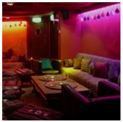
Figure 4: The basement lounge of Darbucka; Source: www.darbucka.com; Accessed: June 29, 2011.

Clerkenwell gentrified many years before nearby Dalston. The former working class neighbourhood could be described as a City fringe; a 'transitional zone where micro and small enterprises can take advantage of the value of centrality without traditionally high city centre rents' (Banks et al., 2000, p. 455; also Keddie and Tonkiss, 2010). Its transformation represents a 're-organisation of urban space to meet changing market demands and ascendant forms of intermediate services production' (Hutton, 2004, p. 95). The area's location also symbolizes