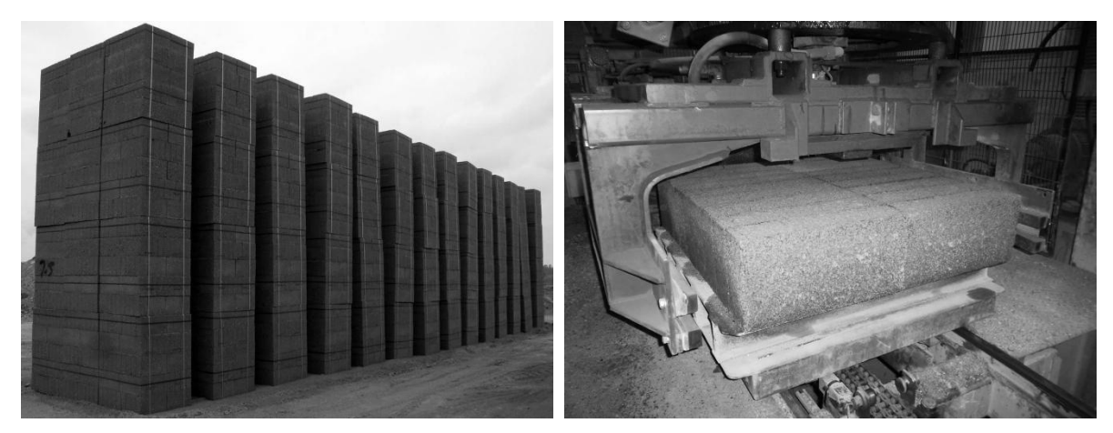
Figure 3. Clockwise from top left – The Brandon plant; aggregate in storage bays; newly formed blocks; and stacked blocks ready for shipping