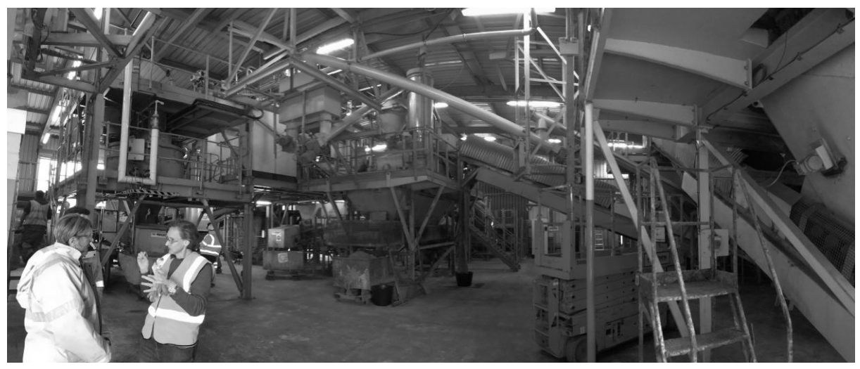
Figure 1. APCr processing plant (second phase)

The commissioning of the carbonation facility in 2012 made it the first commercial plant of its type in the world. Demand for the aggregate was such that a second line was installed in early 2014, increasing production to 36,000 tonne per year (see figure 1).