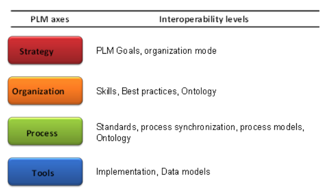
Fig. 1. Interoperability through PLM axes

The implementing of such collaboration requires organizing effective communication between enterprises through integration and interoperability on different levels (Fig. 1)