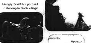
Hengly Sondak - paravet in Kanongan Dua village

This is partly because few communities can afford their high fees, and partly because most ambitious vets want to move on to places where they can make more money. For Lexi, the solution is to find a middle way -- to create community vets, rather than human health services create community nurses. Farming communities need local people trained in a few of the basic skills of veterinary science -- such as giving vaccinations, stitching wounds, treating common diseases, castration and artificial insemination. They need to be people living and working in the community and charging affordable prices.