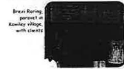
Brexi Raring, paravet in Kowley village, with clients