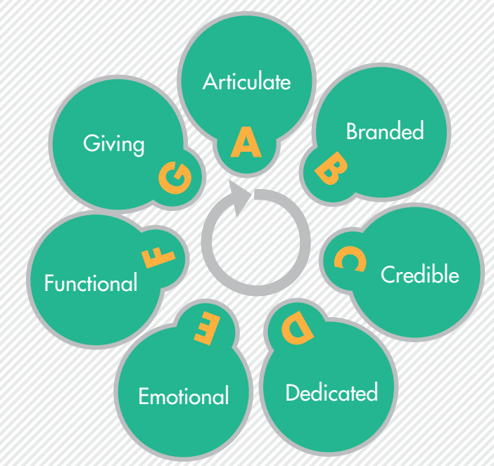
Figure: Attributes and guiding principles of 21st century Marketing: from A-to-G

Articulate: The ability to speak fluently and coherently, injecting ideas, information, and feelings - in the right way, at the right time, and in the right place. 'Speaking' is more than transmitting words and data with pitch, pace and tone; or initiating and responding to communication - it also encompasses the concept of deploying symbols, gestures, and objects. Your products, services, systems, employees and consumers all have to 'speak' to each other - internally and externally. Articulation is also the ability to break things down, join them together and manipulate them in a coordinated yet 'fuzzy' way. This idea of eliciting Gestaltism advocates that, "the whole is other than the sum parts" - there is a bigger picture being painted. Branded: Labelling, claiming, packaging, and joining things together - under one shared interpretive identity. These are the: commodities, services, activities, ideas, communication, individuals and collectives - all in a unified way that is easier to understand, locate, and share. Credible: A readiness and ability to impart authentic, believable, trustevoking, and definitive propositions and communications. This is very much an active and collaborative process. The greater the credibility, the greater the latent and current social capital; and more time people are likely to spend engaging,