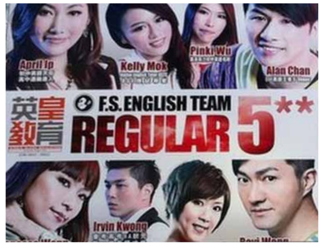
Hong Kong's celebrity tutors take out billboard advertising

A recent BBC News article reporting the findings of a study undertaken by High Flyers in the UK, cites that graduates who have had internships are three times as likely to land jobs; and Marketing is the most popular sector for these jobs. Advertising and Public Relations are the most desired jobs by graduates, with 50% across the UK planning to work in London and 21% overseas. Furthermore, graduate aspirations of wanting to work in cities like London and further afield are indicators that marketers are seeking environments that are culturally rich and multicultural. Over 300 languages are spoken in London; approximately 45% of the population are