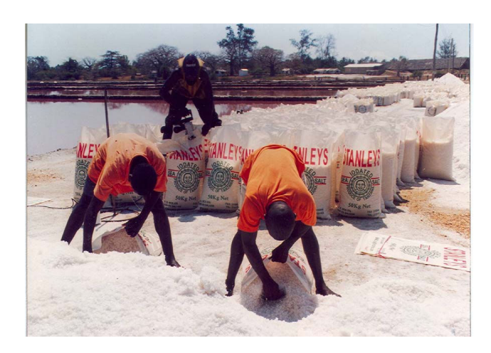
Figure 3 After iodation the process of packaging salt from the heap results in further mixing of salt with iodate and the potential to improve homogeneity.

of flat plastic or wood) to package the salt into the fifty-kg bags (Figure 3).