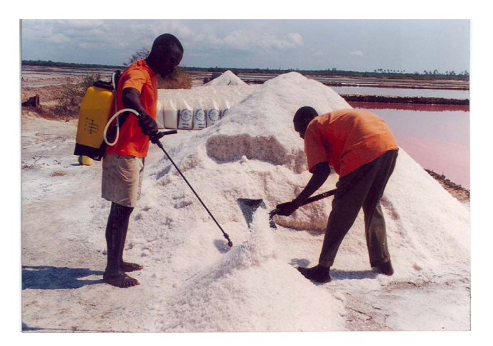
Figure 2 lodation of salt using a knapsack sprayer and manual mixing of a 2-ton salt heap.

The iodine levels achieved using the diesel/petrol-powered cement mixer recommended as an iodate mixing machine [24] were compared with those achieved by the manual mixing method using the mat/polyethylene sheet. For all heaps studied, the workers used a cropper (a piece