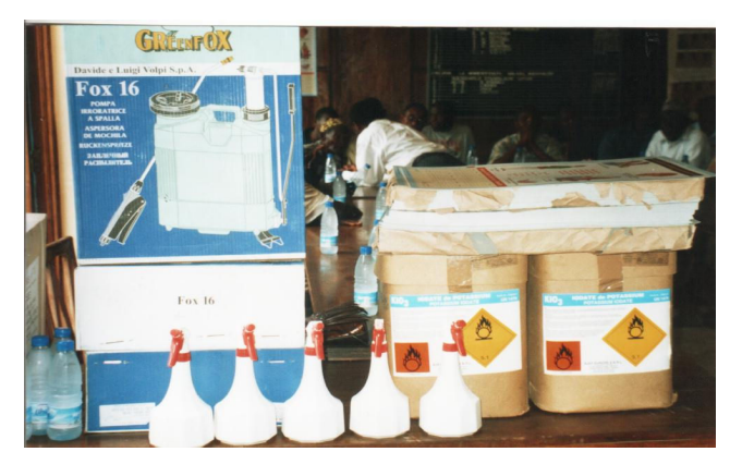
Figure I Essential equipment: knapsack sprayer, hand sprayers (white containers with red nozzle), KIO<sub>3</sub> and instructional literature for small scale salt iodation.

The potassium iodate in use (KIO<sub>3</sub>, molar weight = 214.9 g/mol, estimated cost $18/kg) originated from the INQUIM Company in Chile was purchased through UNICEF. It conformed to U.S. Food Chemical Codex specifications [7].