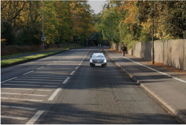
Fig. 1. Example frame from a stimulus used to test thresholds for detecting looming in foveal vision. Each stimulus consisted of a 0.2-s presentation of a photo-realistic image of a car against a contextual road-scene background. For the extrafoveal conditions, the car image was presented at 4.25^\circ eccentricity from the center of the screen.

while allowing for a t_c of 5 s. In a natural setting, any sampling of the scene prior to this time would have had a lower rate of looming than that presented. In the simpler extrafoveal condition (isotropic expansion), the same stimuli were presented extrafoveally by positioning the car image 4.25^\circ from the central fixation point in one of four quadrants. Extrafoveal stimuli would occur in natural scenes if pedestrians did not fixate directly on a vehicle when visually scanning a cluttered street environment. For foveal stimuli, participants viewed the screen monocularly from a distance of 4 m so that the number of pixels per degree would be maximized, whereas for extrafoveal stimuli, they viewed the screen monocularly from 2 m to allow for the angular displacement. Images were automatically rescaled according to the viewing distance in order to ensure that visual angles were equivalent to those that would be experienced at the roadside.