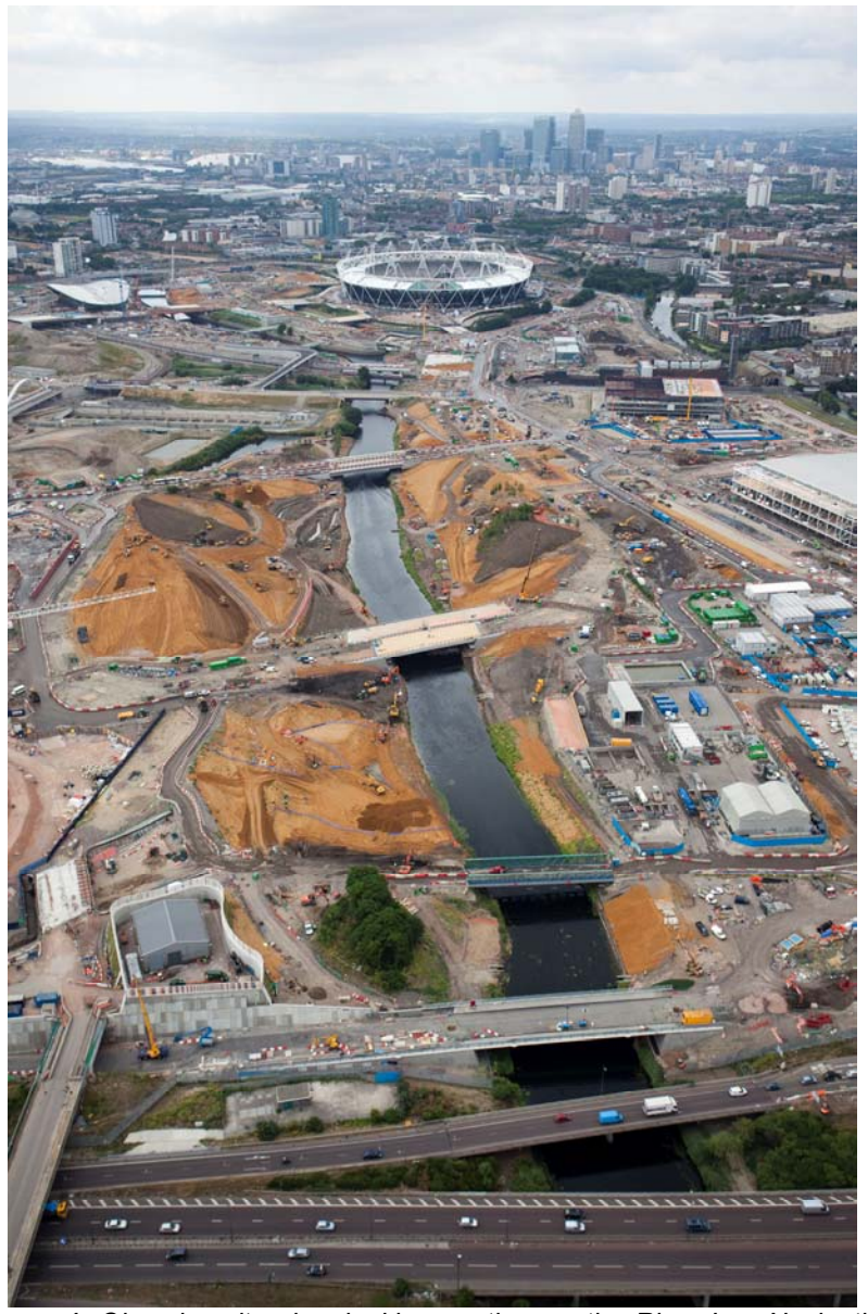
Figure 1. Olympics site view looking south over the River Lee Navigation with the subsoil formation taking place and beyond the main stadium and in the distance the Canary Wharf business district.

"London's bid was built on a special Olympic vision. That vision is of an Olympic games that will be not only a celebration of sport but a force for regeneration. The games will transform one of the poorest and most deprived areas of London. They will create thousands of new jobs and homes. They will offer new opportunities for business in the immediate area and throughout London." [11]