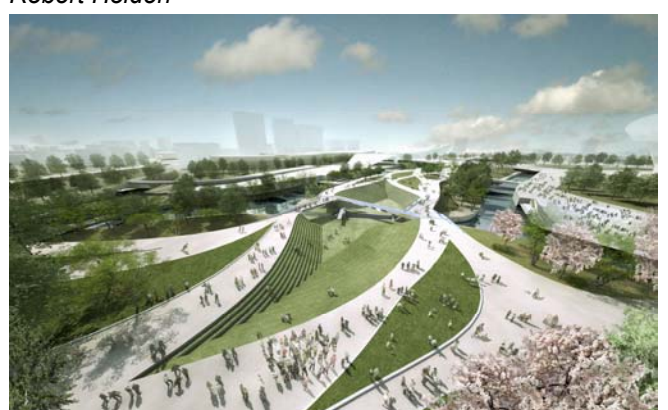
Figure 6. During the Games the park will be dominated by the wide footways

Cities can not generate legacies from Olympic Games without paying effort. They have to invest. Investment in Olympic related infrastructure such transportation, telecommunication and environmental protection will happen in pre-Games period, although there may be some investment that occurs after the Games, such as converting venues for long-term use (31). It means about 10 years period. Paper have been analyzed the legacy aspects of Olympic cities which hosts after 1990. Barcelona, Sydney, Athens, Beijing have been chosen as cases while it was focusing on London. While doing this, it has reviewed especially economical aspects. Olympic related investments and expenditures have been investigated related to the outcomes. Thereby, 2012 Games claim to address, with the legacy of the Games being linked to challenging the underlying social, physical and economic problems of East London.