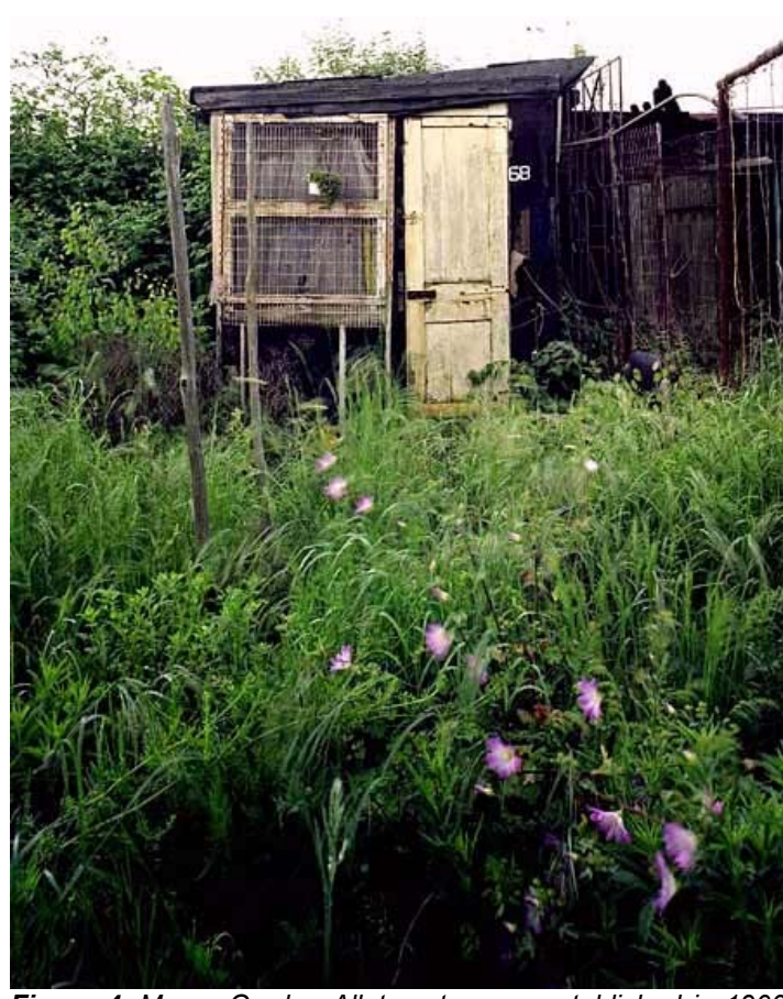
Figure 4. Manor Garden Allotments were established in 1900 by Major Arthur Villiers, a banker director and philanthropist, to provide vegetable gardens for East Enders, they were destroyed to make way for the Olympics in 2007 (http://www.peterhoare.co.uk/photography/allotments/allots01.html)

The place will no longer appear like the East End of London, it will no longer be revealing of the genius loci . Elsewhere in London, from Covent Garden, to Camden Lock to St James's