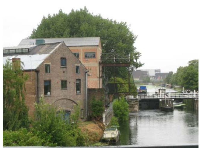
Figure 5: Old Ford Lock, Lee Navigation typifies the industrial heritage of the site which has been lost