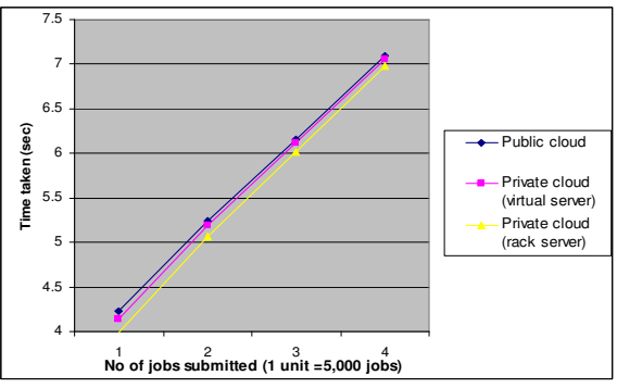
Figure 3: Timing benchmark comparison for GridSAM 2.3

This relates to Middleware Framework (MF) which contains core CCBF components such as GridSAM for portability. GridSAM 2.3 is chosen as it is widely used in the UK community and is very easy to modify the Job Submission Description Language (JSDL) for job submission. GridSAM 2.3 allows multiple submissions for up to 20,000 jobs submitted at each instance. A Java program, Primes, is written to list prime numbers, and is able to submit jobs to Private and Public Clouds. Here is an example: Two JSDL files, primes-0to10000.jsdl and prime-10001to20000.jsdl are written to send 20,000 jobs, and a primes_file.pl is modified to lists prime numbers between 0 and 20,000. This includes two stages. Firstly, it involves with job submission and its status check. Secondly, the result is computed and stored in the GridSAM client. For Cloud demonstrations, the first stage is used to measure the time taken of the job submission, and compare required time with the same set-ups and experiments described in Section 4. The GridSAM 2.3 server does not support desktop. Hence, Public and Private Clouds are used for experiments, with their outcomes summed up in Figure 3.