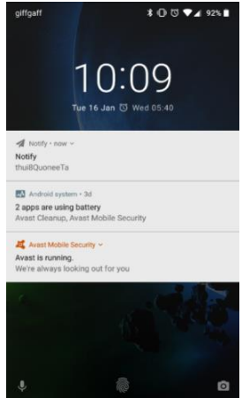
Fig. 2. Updated Password has been notified to the Android device by using app Notify

By comparing OSPF and RIP with a wireless network, it is clear to see that RIP is the superior routing protocol when it comes to the context of this papers' network, (see Table 3).