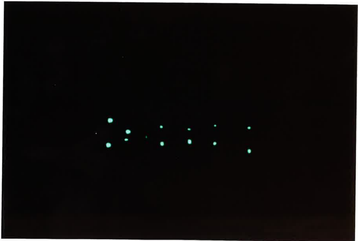
Figure 2: Examples of monitor display with different screen brightness settings. (a) The screen brightness is set high enough to show all the targets as very bright spots, but specular reflections from the leaves are also visible, complicating the picture. (b) At a lower setting the reflections from the leaves disappear, and as the brightness setting is progressively reduced, the less effective markers disappear one by one.