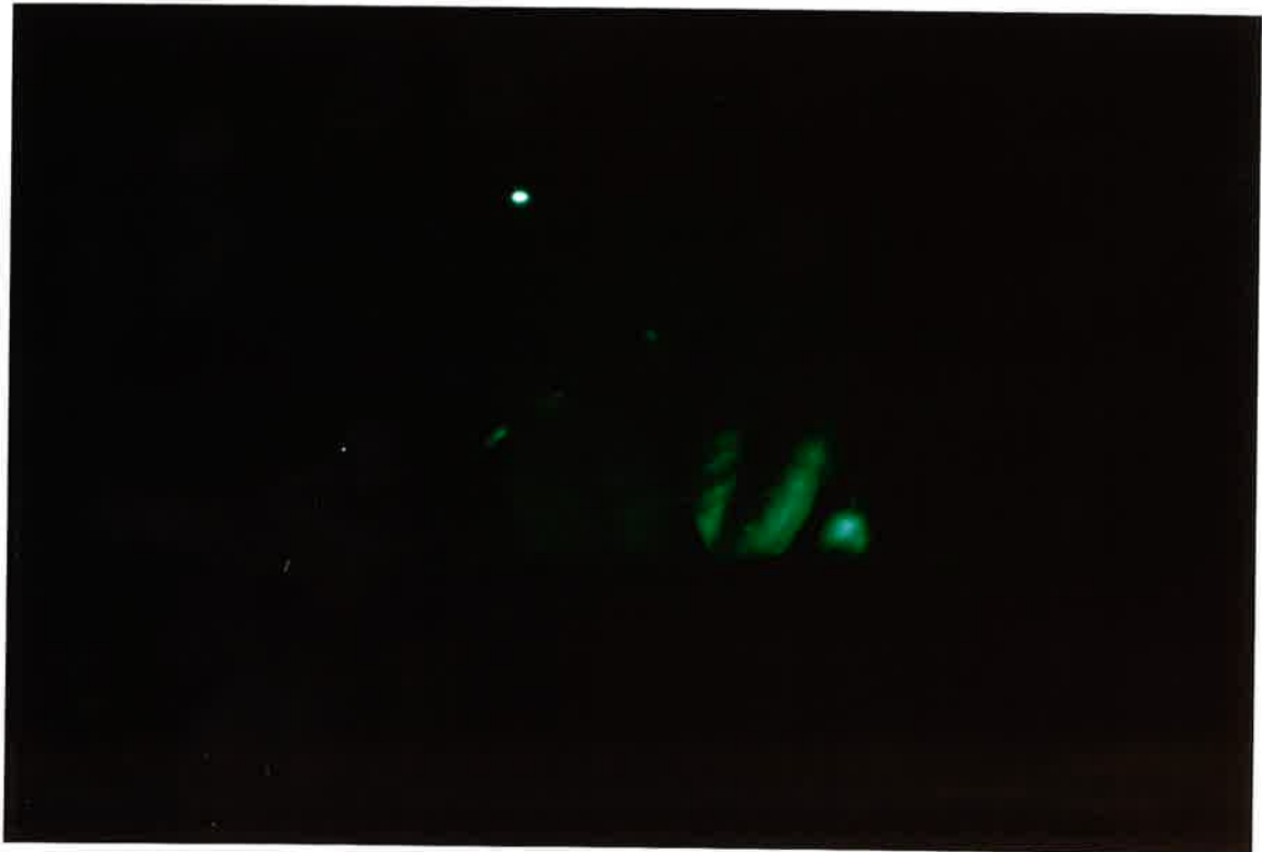
Figure 3: Example of visibility enhancement achieved by marking leafhoppers. (a) Close-up photograph in natural light of two N. virescens seen against foliage; the upper one carries a small Reflexite marker. (b) Video view from a range of 3 m: only the marked leafhopper is visible (bright spot) together with some specular reflections from the leaves.