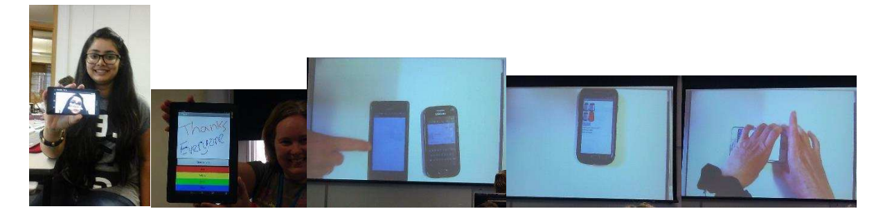
Figure 3: Apps developed at Greenwich

The success of the event at Greenwich was evident from both the formal and informal responses we got on the day and after the event; for example, the participant who developed the app for skaters remarked in an email after the event: