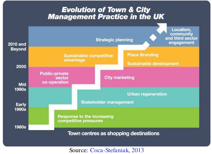
Figure no. 2 – Evolution of town centre management practice in the UK

Today, the city manager's role across Europe involves managing key stakeholders that may often represent different 'layers' of a town or city centre, including managers of smaller places within the urban realm, such as shopping centres and shopping malls, universities, cultural institutions, third sector organisations, housing associations, residential areas under development (construction), and special funding models of Town Centre Management such