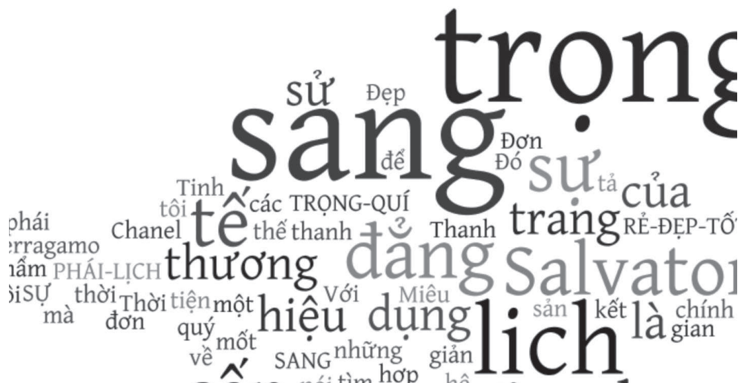
Figure 3. Examples of word in Vietnamese generated by clouds

ated to analyse key words and patterns; the following being an example of one of them.