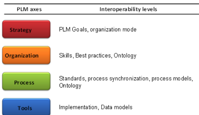
Fig. 1. Interoperability through PLM axes

The implementing of such collaboration requires organizing effective communication between enterprises through integration and interoperability on different levels (Fig. 1)