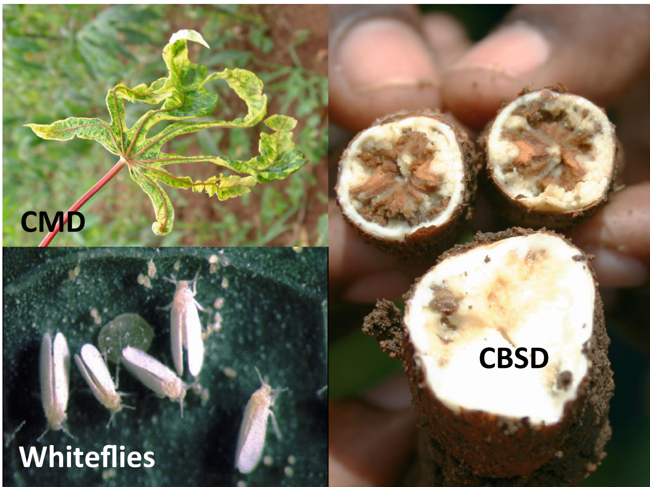
Fig. 1 Symptoms of cassavamosaic disease (CMD) ( upper left ) and of cassava brown streak disease (CBSD) ( right ), both diseases being transmitted by the super-abundant populations of whiteflies ( Bemisia tabaci ) ( lower left ).