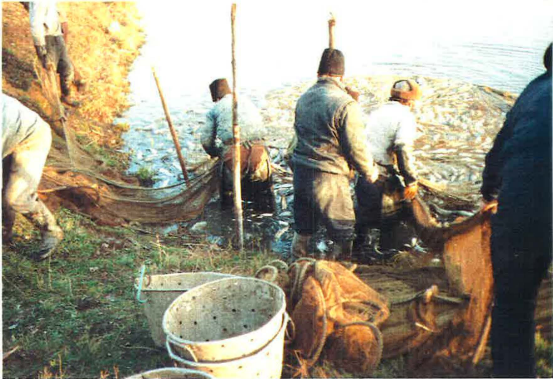
1. Early morning harvest, Tiganasi Fish Farm, Iasi