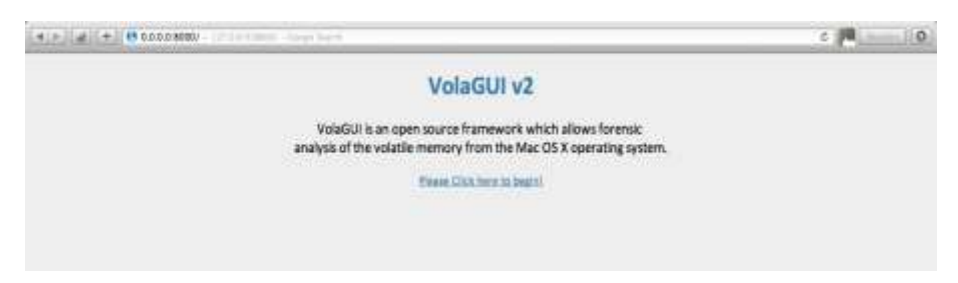
Fig. 1. VolaGUI home page

The application has been tested and the results are presented here. Fig. 1 shows the home page for VolaGUI. As can be seen the style is simple and feedback is given to the user on the first page so that they stay informed throughout the examination process.