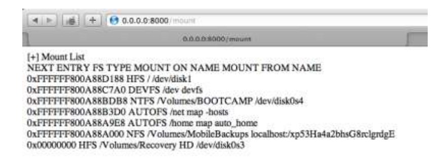
Fig. 4. VolaGUI output from Mount analysis

The module Tasks returns a list of tasks running on the machine, see Fig 5. for a sample section. A useful feature of this is that the user's name is also listed which can be particularly useful if, for example, the case related to a hacking attempt.