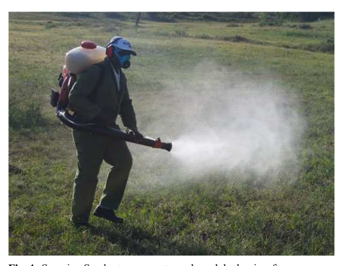
Fig. 4 Spraying Spodoptera exempta nucleopolyhedrovirus for armyworm control in Tanzania (W. Mushobozi)

SpexNPV (Spodoptera exempta nucleopolyhedrovirus) is a natural pathogen of the African armyworm and is a member of the baculoviruses (BV), a group specific to invertebrates that have been developed as biological pesticides for a number of lepidopteran species (Moscardi 1999; Lacey et al. 2001: Fig. 4). A major review of over 50 years of BV use has judged them to be safe for pest control (O.E.C.D 2002). Indeed, many BVs such as SpexNPV are so specific that they infect only a single, or a few closely related, host species (Cherry 1992). SpexNPV was first identified as a potential BCA in the 1960s when research determined that it was an important factor in the collapse of some armyworm outbreaks (Brown and Swaine 1965). However, this research also indicated that SpexNPV tended to appear only late in the seasonal cycle of armyworm outbreaks, and in most years it failed to prevent serious outbreaks and crop losses (Odindo 1983). While there was some interest in