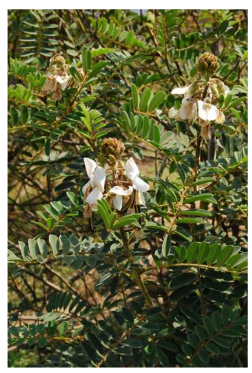
Fig. 1 Tephrosia vogelii, a pesticidal plant widely used for pest control in Malawi (P.C. Stevenson)

Comprehensive lists of African pesticidal and deterrent species are available (e.g., Stoll 2000) that provide potential solutions against many major agricultural pests in SSA using low-technology preparations and application methods. It should be noted that many plant species reported to be effective for pest control still require scientific validation in the field because of the inherent geographical and seasonal variability in biological activity in some plant species. Analytical chemistry is required in the selection of elite plant materials being chosen for propagation or cultivation to ensure that they are effective (Stevenson et al. 2012; Sarasan et al. 2011). One good example of a cultivated multi-use species with pesticidal properties is Tephrosia vogelii Hook f., which has been used across Africa as a pesticide, as animal fodder and for improving soil fertility (Burkill 1995; Mafongoya and Kuntashula 2005; Neuwinger 2004; Kamanula et al. 2011: Fig. 1). The positive potential impact on poor farmers' livelihoods in SSA of this multi-use plant is compelling, and it is now widely