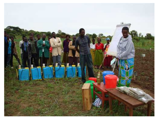
Fig. 2 A farmer awareness day in Malawi; lead farmers demonstrate the use of pesticidal plants (P.C. Stevenson)

For many pesticidal species there is insufficient knowledge about their propagation to make large-scale cultivation feasible. The use of wild plants is sustainable where they are abundant or where the number of farmers using them matches the capacity of the ecosystem to replenish stocks. However, there are already examples where the demand for medicinal plants has outstripped supply (Shackleton et al. 2005;