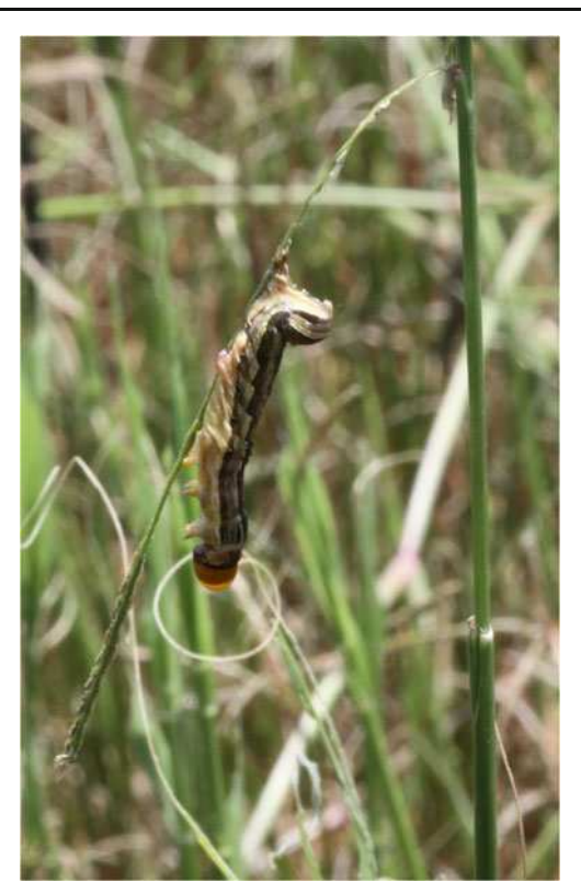
Fig. 5 African armyworm killed by Spodoptera exempta nucleopolyhedrovirus showing discharge from head containing infectious occlusion bodies (K. Wilson)

A great advantage of SpexNPV, as with other BVs, comes from it being an 'occluded' virus. This means that its infective virus particles come naturally encapsulated in a stable protein crystal matrix that gives it good persistence and robustness, with potentially a long shelf-life (Smit 1997). Another advantageous property of BVs is their systemic infectivity; a wide range of host tissues are infected. This makes for a faster host kill and, very importantly, massive multiplication of virus in infected insects. A dead SpexNPV-killed armyworm may contain 200 million infective occlusion bodies (OB), each of which harbours >100 infective virions, and a dead larva may comprise > 15 % dry weight of OB (Cherry et al. 1997: Fig. 5). This makes producing SpexNPV in live larvae very efficient and means that insects killed by virus release massive numbers of OB into the environment on death, helping to spread the infection and promote its persistence. This property of SpexNPV to multiply in infected insects, and then to generate new infections ('secondary cycling'), gives it a means of