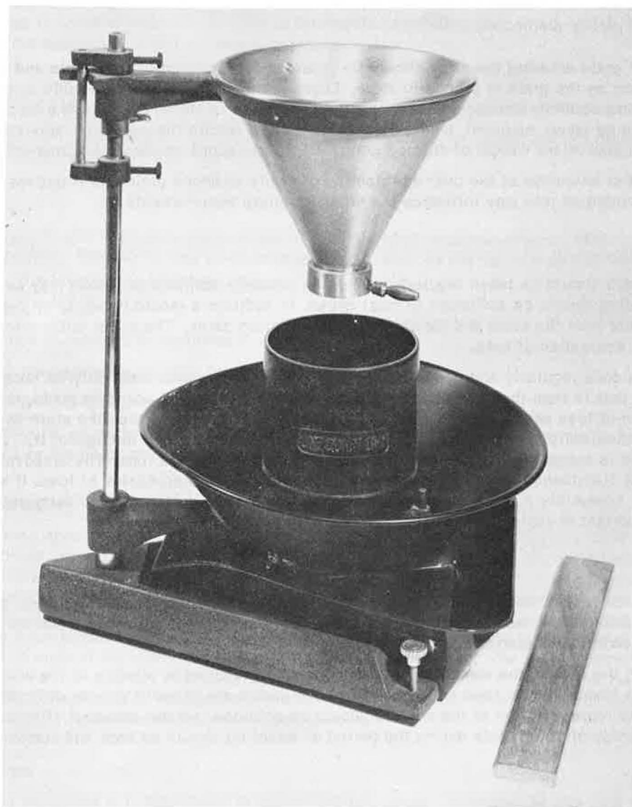
Fig 1. Apparatus for obtaining a standard value of grain.

An accurate method for estimating weight loss is the use of the dry weight of a standard volume of sieved grain. This is done using a simple apparatus (Fig 1) and a balance. The moisture content of the grain must first be measured to convert the weight to dry weight. In doing this consideration needs to be given